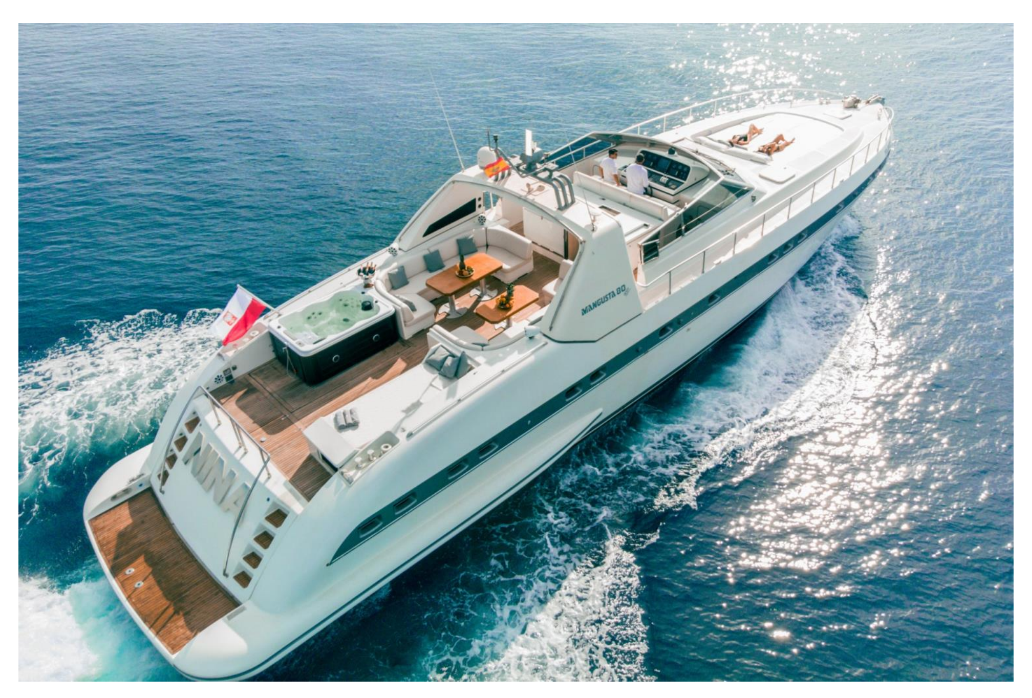
>> Complete interior and exterior refit in 2021