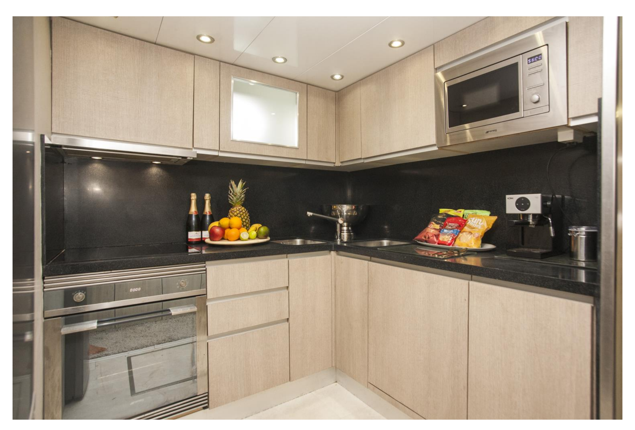
>> A fully equipped kitchen