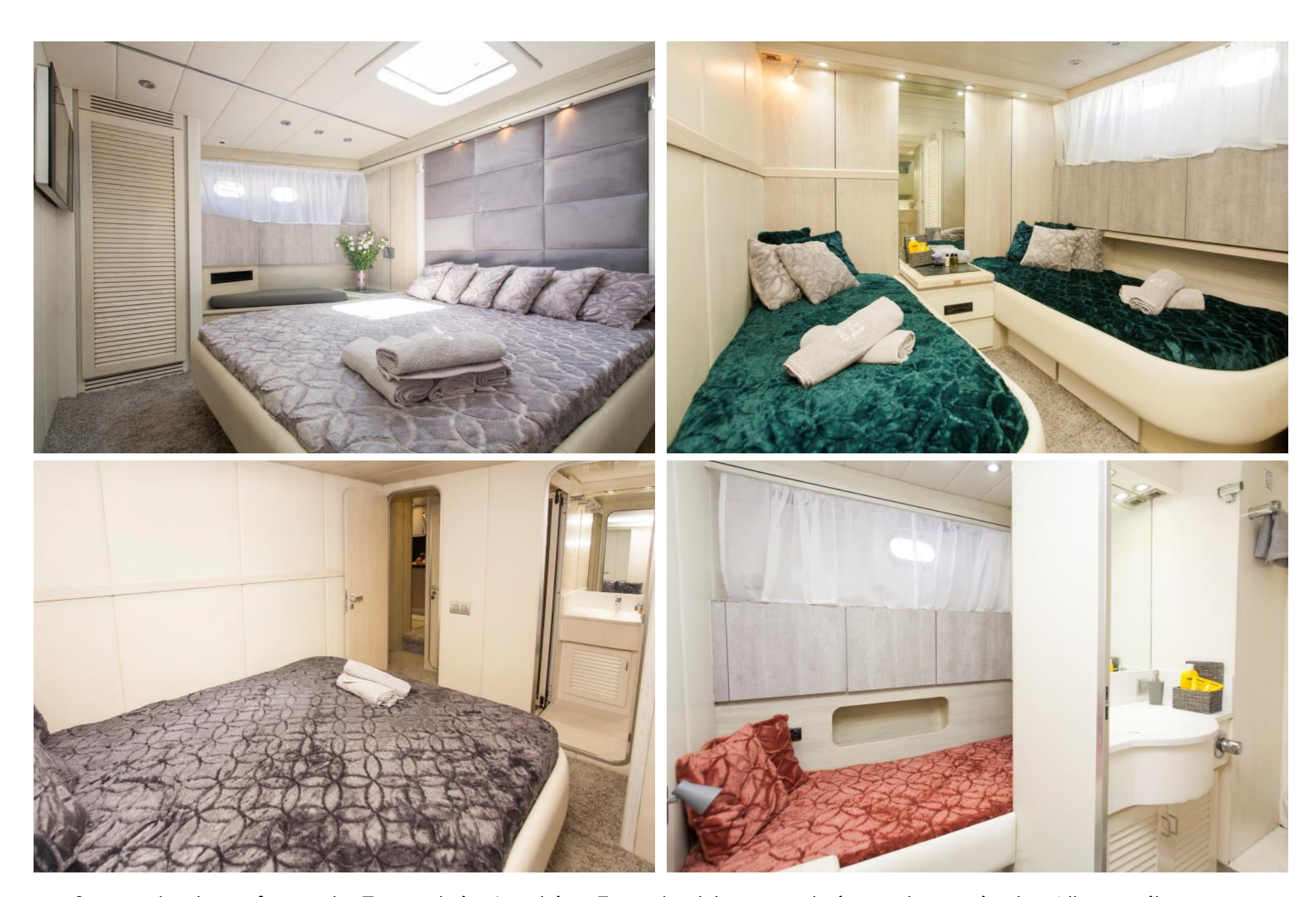
>> Space to sleep for up to 7 guests in 4 cabins. Two doubles, one twin and one single. All en-suite.