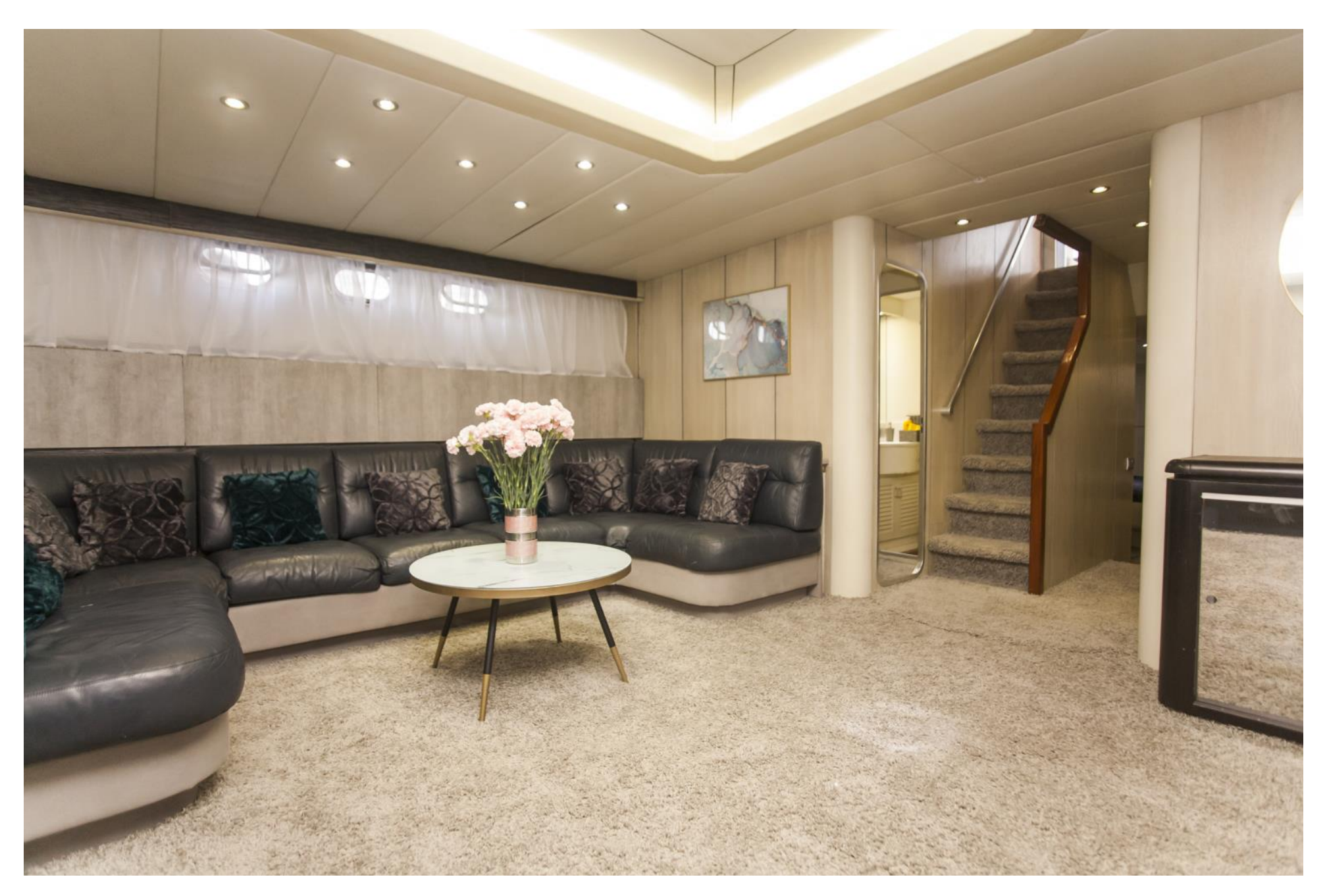
>> Full beam saloon with huge sofa to relax