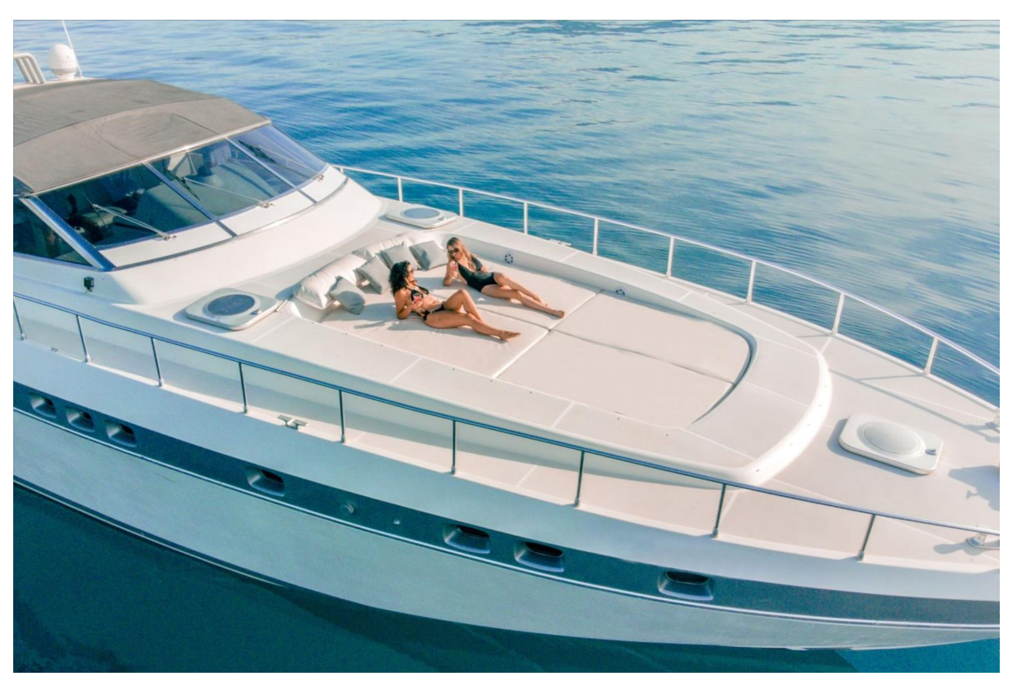
>> Very large solarium on the front of the boat with integrated speakers