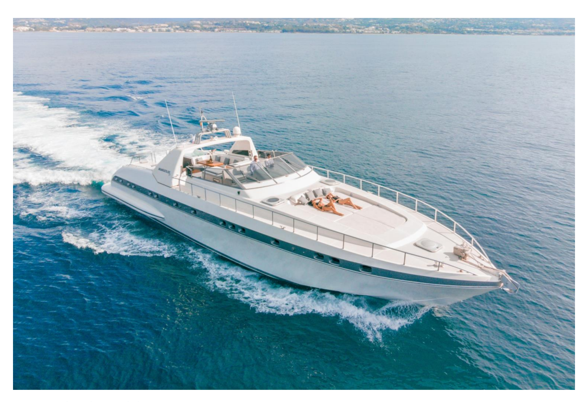
MANGUSTA 80 1999 (REFIT 2021)