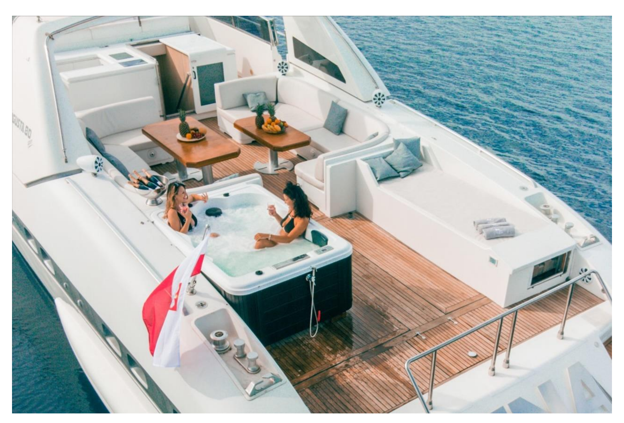
>> Enjoy out heated jacuzzi with your friends