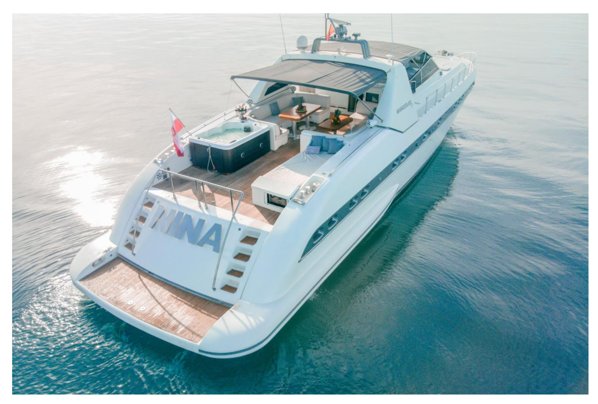
>> Big shaded area to escape from the Sun