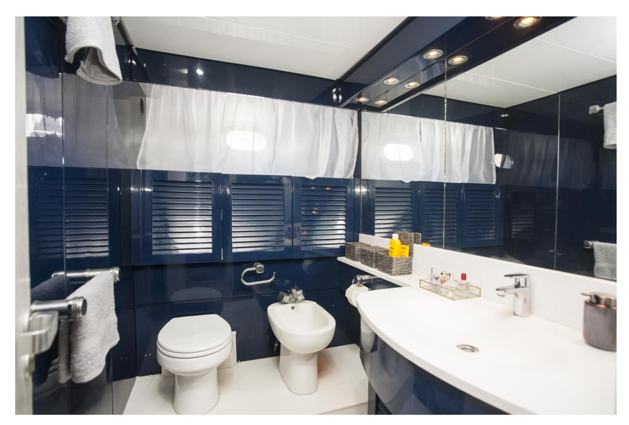
>> Master bathroom with separate shower