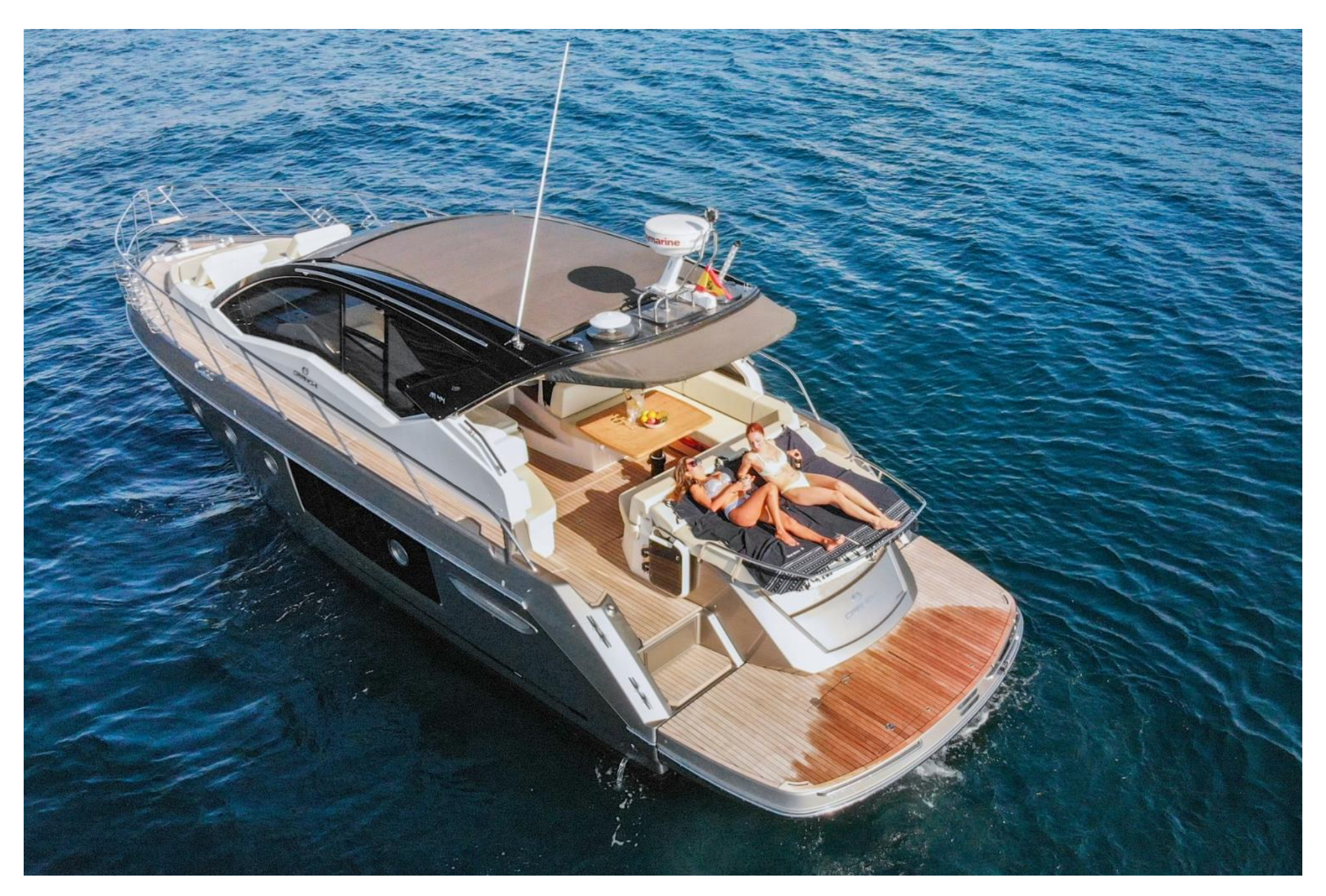
>> Spacious aft sunbed and a bathing platform with easy access to water