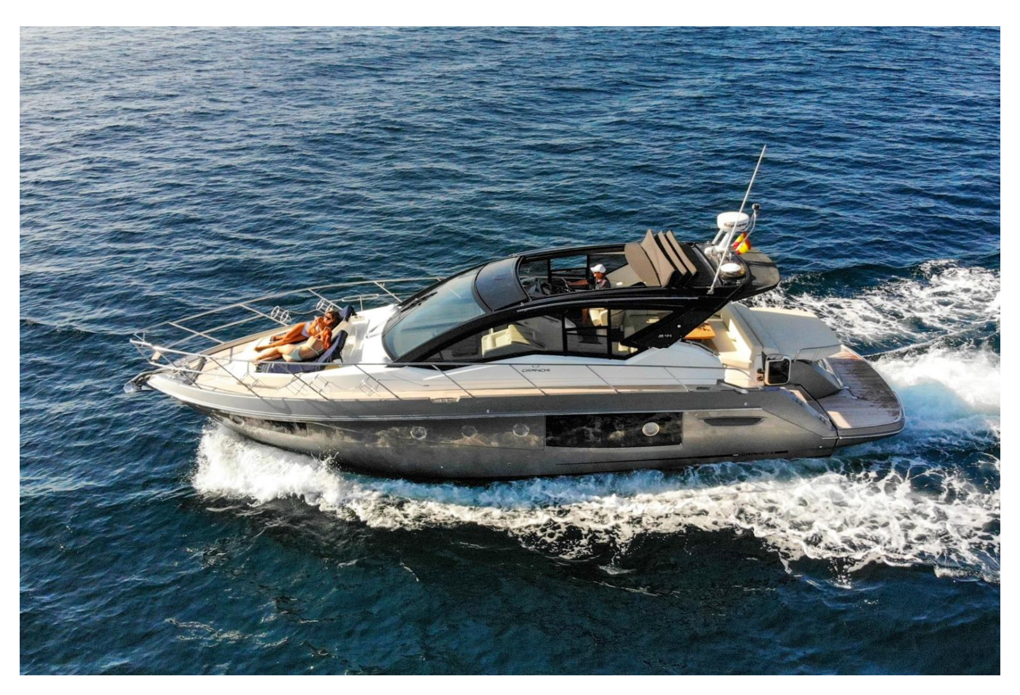
CRANCHI M44 HT 2022