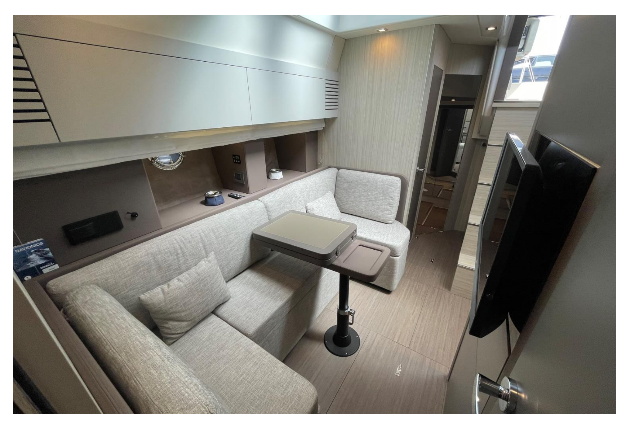
>> Modern saloon inside