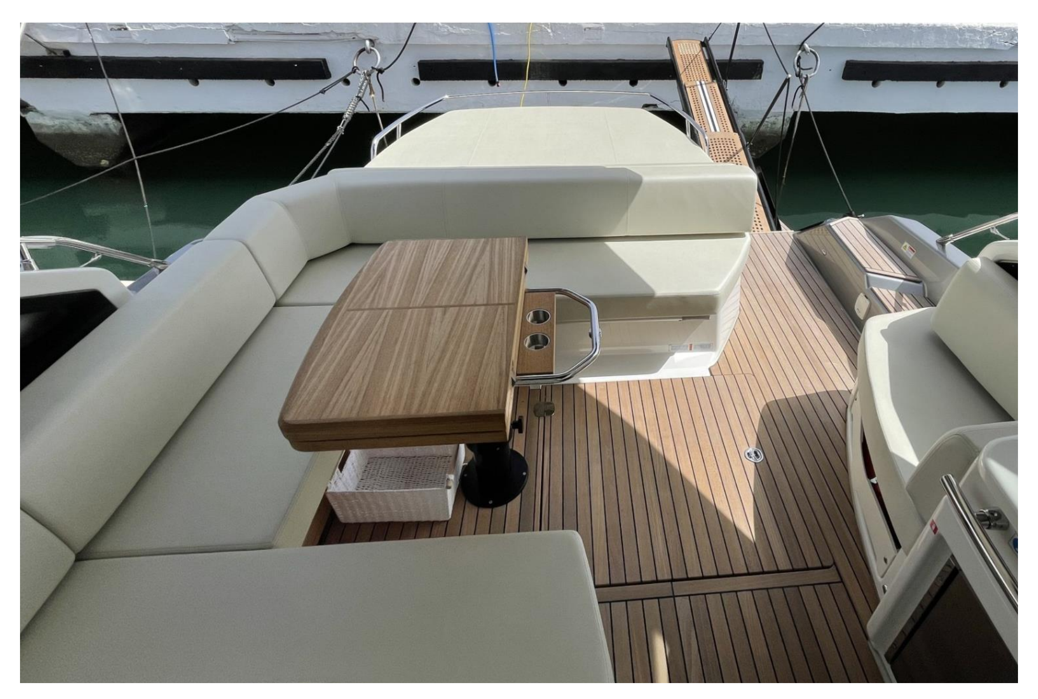
>> Plenty of exterior space and ample seating area with a table